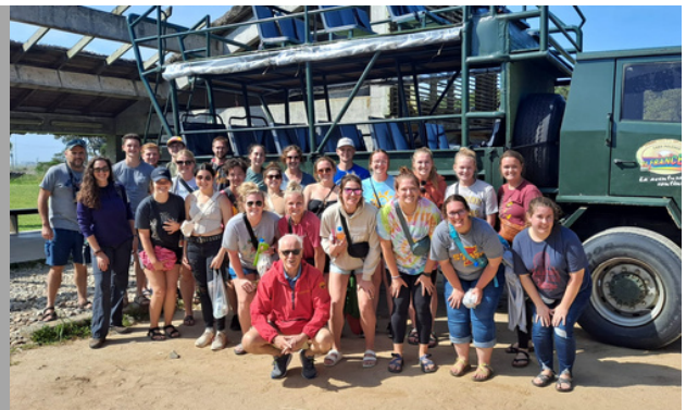
Soils, Agriculture, and the Environment in Uruguay