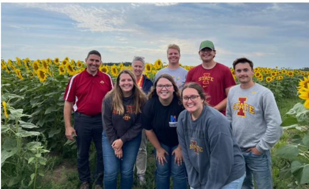
Field to Fork on the US Prairie (Study USA)