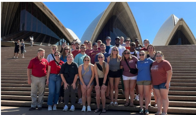
Ag Business, Production and Trade in Australia

5. Attend Class and Prepare to Travel. Faculty-led travel courses typically meet as a group during the semester before travel. Throughout the course, you will learn about the country, aspects of the travel, and other components of the program established by the program directors. These classes help you learn about the location(s) you will be visiting and get ready for the trip!