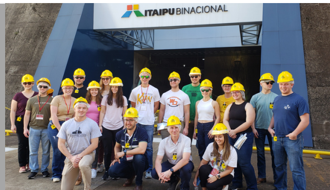
Business Development in Brazil and Argentina